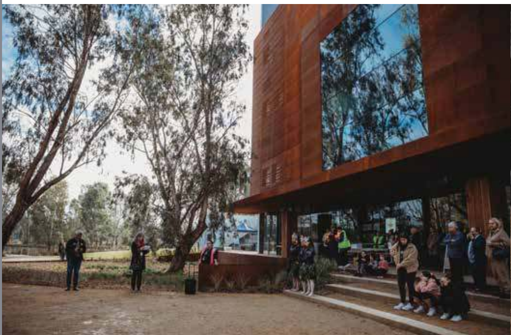
Photo on cover, above and right taken at Turtle Muster on the lake