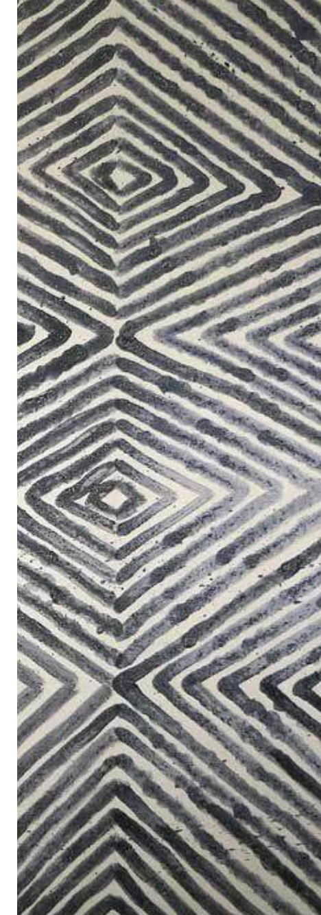
Above: DETAIL Eric Brown Initiation #2 , 2021 Charcoal on canvas 122 x 152cm

*Dates may be adjusted due to COVID, notifications will be posted via social media.